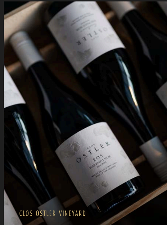
CLOS OSTLER VINEYARD