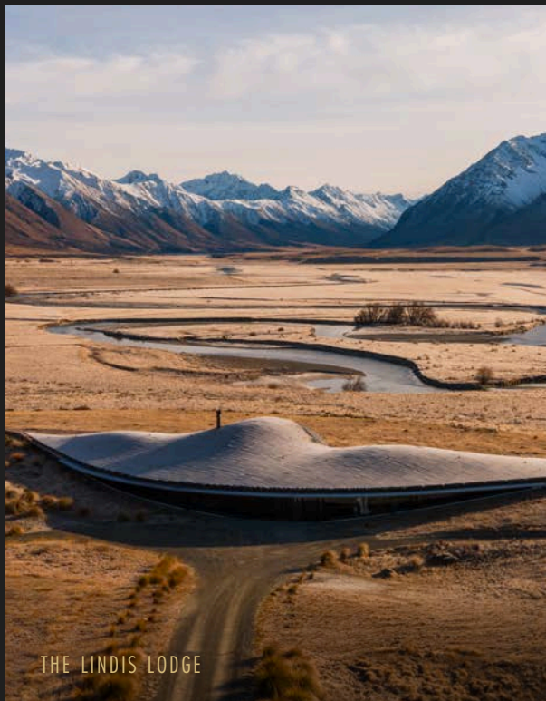
THE LINDIS LODGE