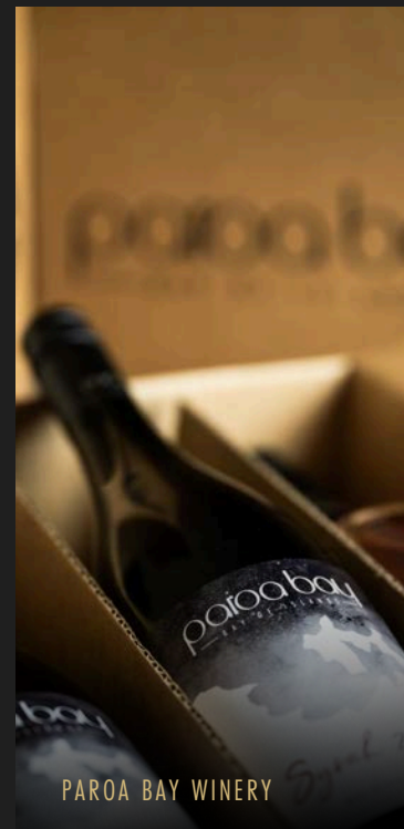
PAROA BAY WINERY

The Lindis Group | www.thelindisgroup.com/shop