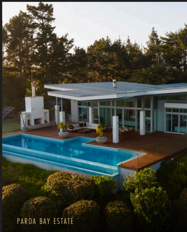
PAROA BAY ESTATE